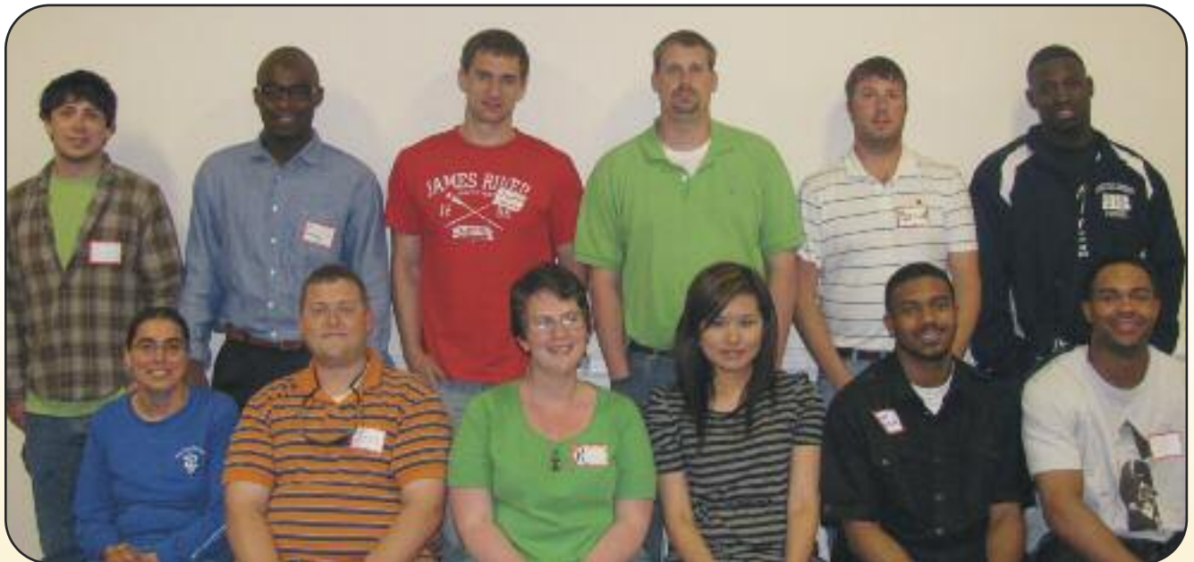
North Carolina Trainees